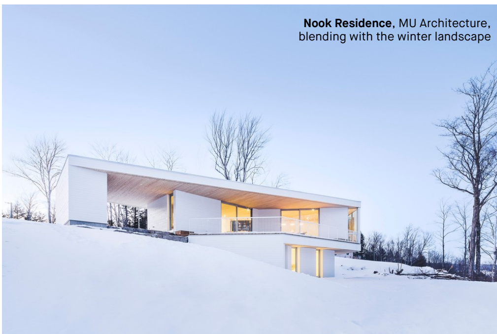
Nook Residence , MU Architecture, blending with the winter landscape

A look forward at upcoming CPDs, events and conferences that will assist you in maintaining currency of knowledge and your annual CPD obligations