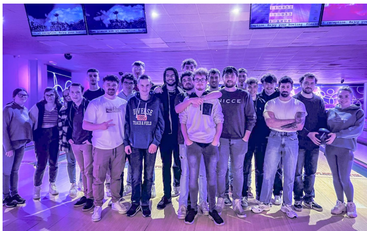
A selection of photographs from the first Republic of Ireland Centre aspirATion event in collaboration with ATU, Galway.