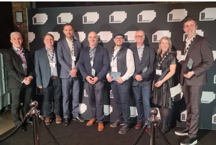
Irish Representatives and Winners at the AT Awards 2023 in the Village Underground, Shoreditch, London (from left):

The public consultation period remains open for feedback until 5:00pm on Friday, 12 January 2024 .