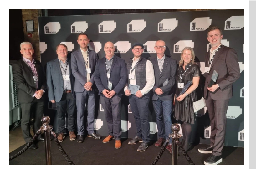
Irish Representatives and Winners at the AT Awards 2023 in the Village Underground, Shoreditch, London (from left):

projects and advanced technologies. Registration for the event is essential and you can do so at Eventbrite here.