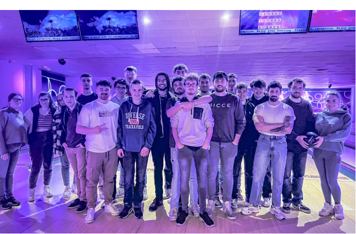
A selection of photographs from the first Republic of Ireland Centre aspirATion event in collaboration with ATU, Galway.