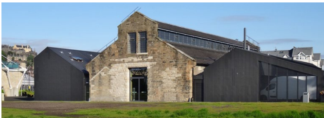
The Engine Shed building with Footbridge access on LHS from nearby Railway Station (Stirling Castle in background)