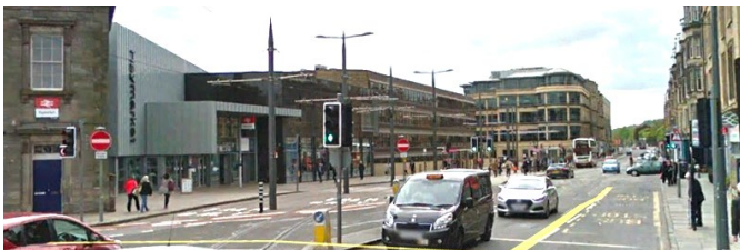
Edinburgh Haymarket Interchange: The Tram stop is on the central island; Airport bus stop is on the RHS

Stirling is frequently served by trains from Edinburgh and Glasgow, and by regular LNER trains from London changing at Edinburgh Waverley (for a Dunblane train). Train tickets from London Kings Cross to Stirling can start from as little as £26.50 Standard Class if booked well in advance. Flying into Edinburgh Airport will require a Tram or Airlink 100 Bus journey to Haymarket Station from where the frequent train service runs to Dunblane via Stirling.