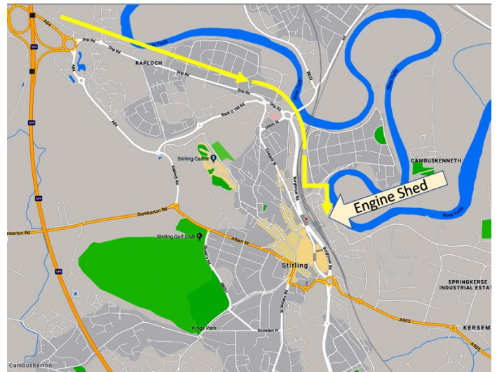
Travelling by car: Leave M9 at Junction 10 for A84; then Drip Rd and Burghmuir Rd; then turn left over Railway Bridge