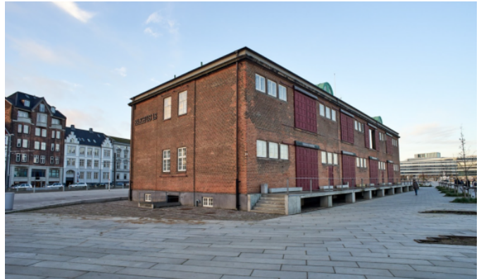
Aarhus office of Schmidt Hammer Lassen.

Schmidt Hammer Lassen(SHL): http://www.shl.dk/