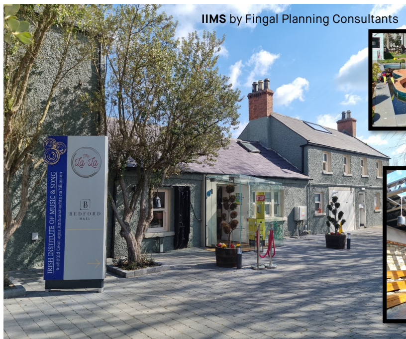
IIMS by Fingal Planning Consultants