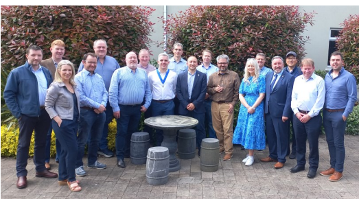
Centre Officers, Members & Affiliates who enjoyed the Post GBM Dinner in Silks Restaurant, Horse & Jockey, Thurles.

Later that evening, we enjoyed a 3-course meal in Silks Restaurant and were joined by partners for a sociable networking evening which extended into the small hours. Keep an eye out for future events which we are planning across the country to meet more members and affiliates in both professional and social capacities.