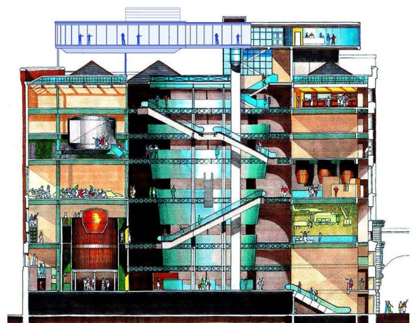
Cross Section of the Guinness Storehouse Gravity Bar Expansion Proposal - RKD Architects