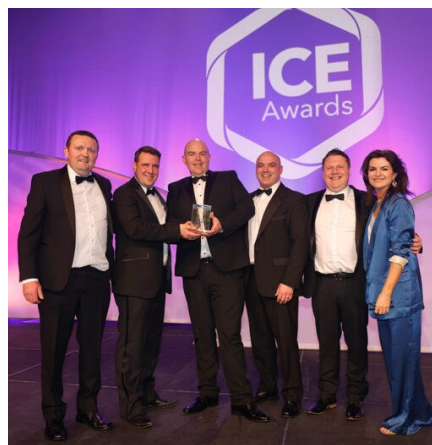
Winner - Residential, Single Dwelling Existing Dwelling Deep Retrofit and Energy Upgrade, Co. Offaly by MMA Architects & TeknaBuild