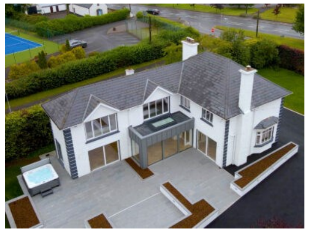
Winner - Residential, Single Dwelling Existing Dwelling Deep Retrofit and Energy Upgrade, Co. Offaly by MMA Architects & Teknabuild

Important update for practising members in relation to fire exclusions