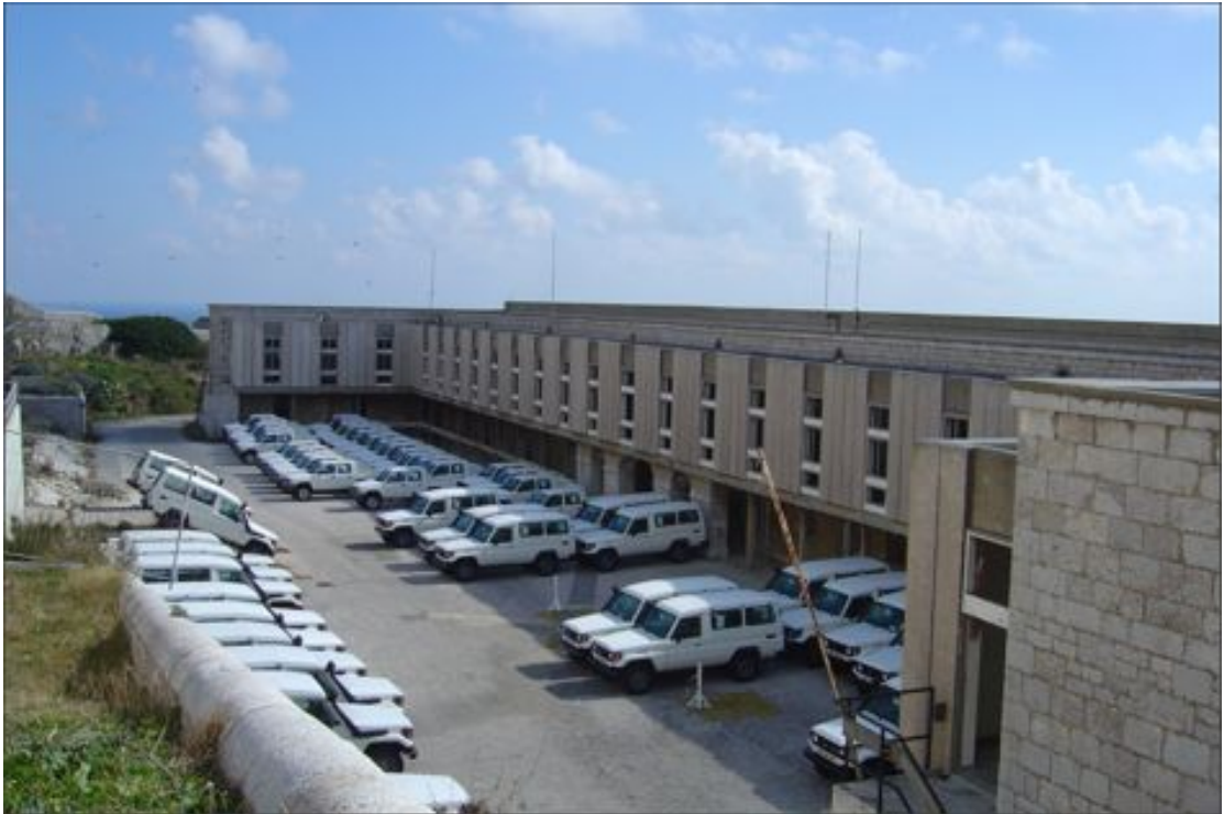
MOD building with 1960s prefab concrete corridor & office structure.