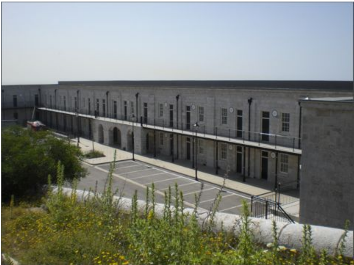
Lime stone retrenchment block restored to former glory.