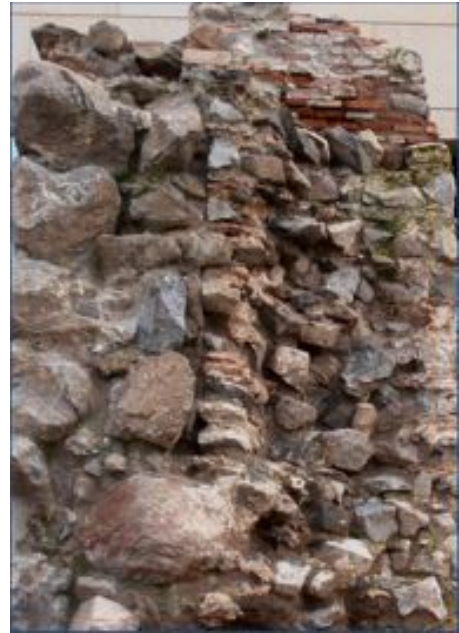
Typical random rubble wall.

New modern steel or concrete methods of construction are very similar to the UK and Europe. With cavity construction, single skin blockwork with insulated EPS systems and metal / timber decks. Some external clad systems have been used on various projects though luckily none affected by the Grenfell tower disaster. Traditional masonry methods tend to be used where local trained expertise from Spain and Portugal, are to hand.