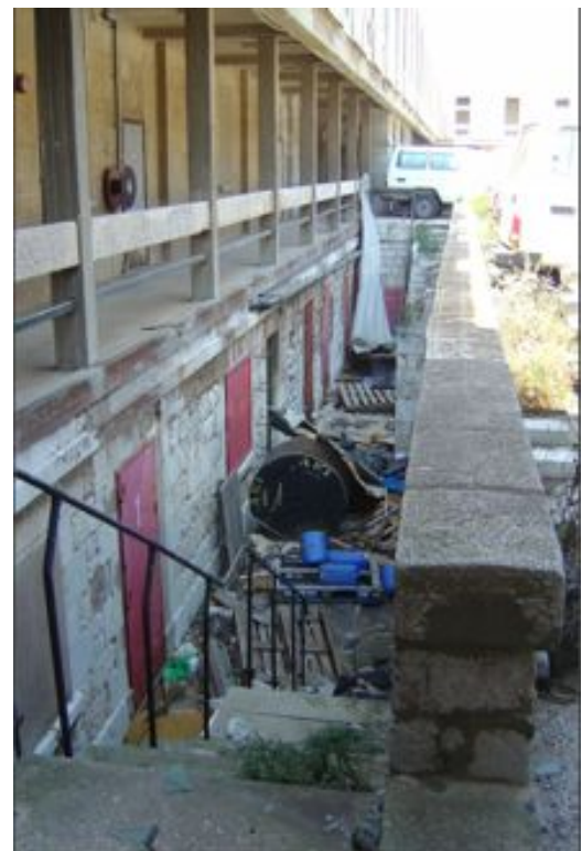
Before the works commenced