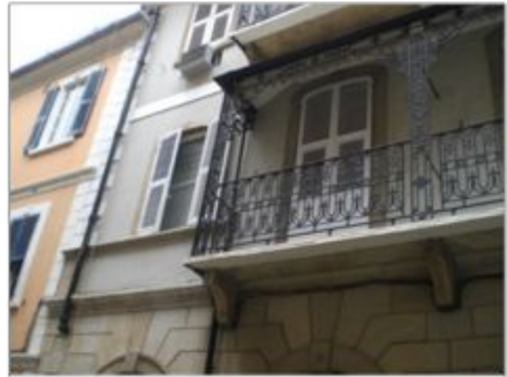
A typical facade with Genoese shutters..

The one feature common was the Genoese shutter – a typical timber shutter originating in northern Italy. This louvred shutter was highly efficient in keeping out the sun and maintaining an even temperature within. It also has a practical “spy panel” in the lower half that provides shade, increases airflow and ensures privacy from adjacent neighbours.