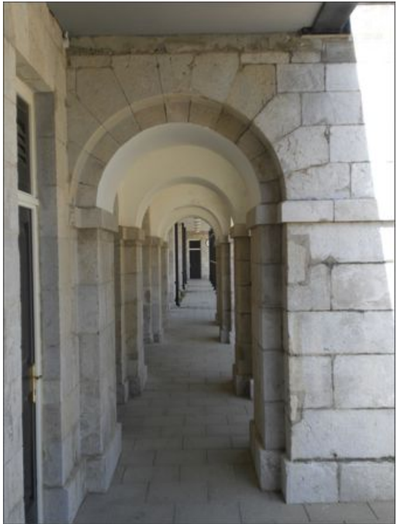
Former 1960 prefab corridor and office space demolished, with hidden lime stone exposed and restored.

If you would like to write a “spotlight” feature to be included in future editions of the Centre Newsletter then please contact anyone on the Committee.