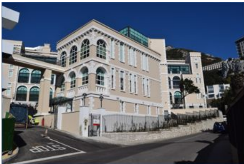
Royal Navy Hospital. Refurbished into elderly care and mental health facilities.

Gibraltar has gone through various phases in recent years. We had the influx of gaming companies, all requiring more and more office space. Which therefore led to numerous properties, especially in the town centre, being refurbished ( and change of use) from residential to offices.