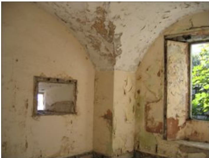
Internal vaulted rooms suffering from extensive damp and water ingress.

This forms only one small example of former military buildings, handed back to the Gibraltar Government, and given a new lease of life.