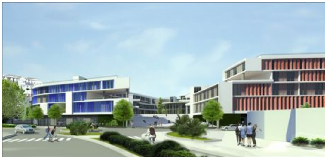
New Comprehensive schools project.

The Government is currently undergoing a campaign pledge to build new schools across the board, with 8 schools being demolished or refurbished. The main development being 2 large secondary schools ( Bay Side and West Side) separate boys and girls schools coming together on one site, as 2 mixed comprehensive schools ).