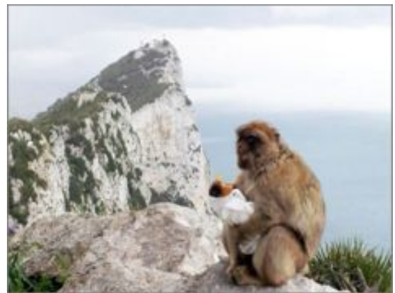
A Macaque taking lunch..usually someone else's!