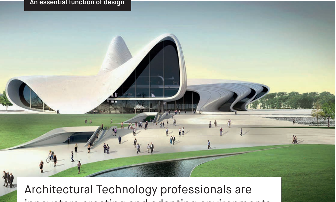
Heydar Aliyev Cultural Centre, Zaha Hadid Architects

Architectural Technology professionals are innovators creating and adapting environments for future generations to live, work and play.