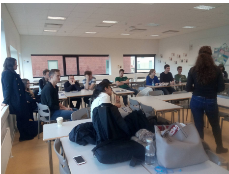
First event of the new AspirATion Group .

The Group's mission is to act as a stronghold of CIAT outside the UK, promote the discipline and establish a quality network between local students and potential employers across Denmark and Europe.