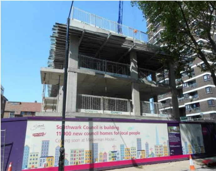
Masterman House, an ongoing project