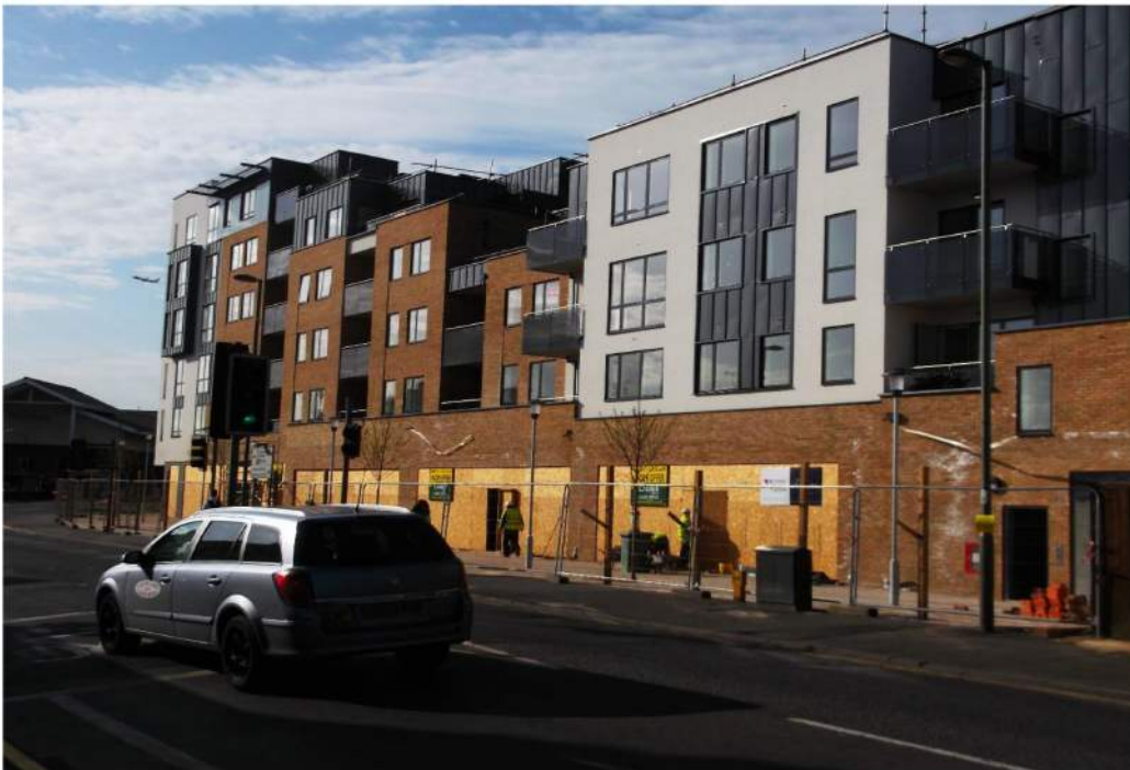
Newman House, finished project

Our journeys have so far been exciting, and the future promises so much more. Whatever role you find yourself in, try to understand how your design decisions correlate within the wider picture, be it within design, technical or both. There is no shortage of innovative and inspiring career paths available for any Architectural Technology professional. Most of all be proud of your qualifications and profession. As a CIAT member, you are part of an organisation that has helped mould the built environment around you for the last 50 years. You are the future of CIAT.