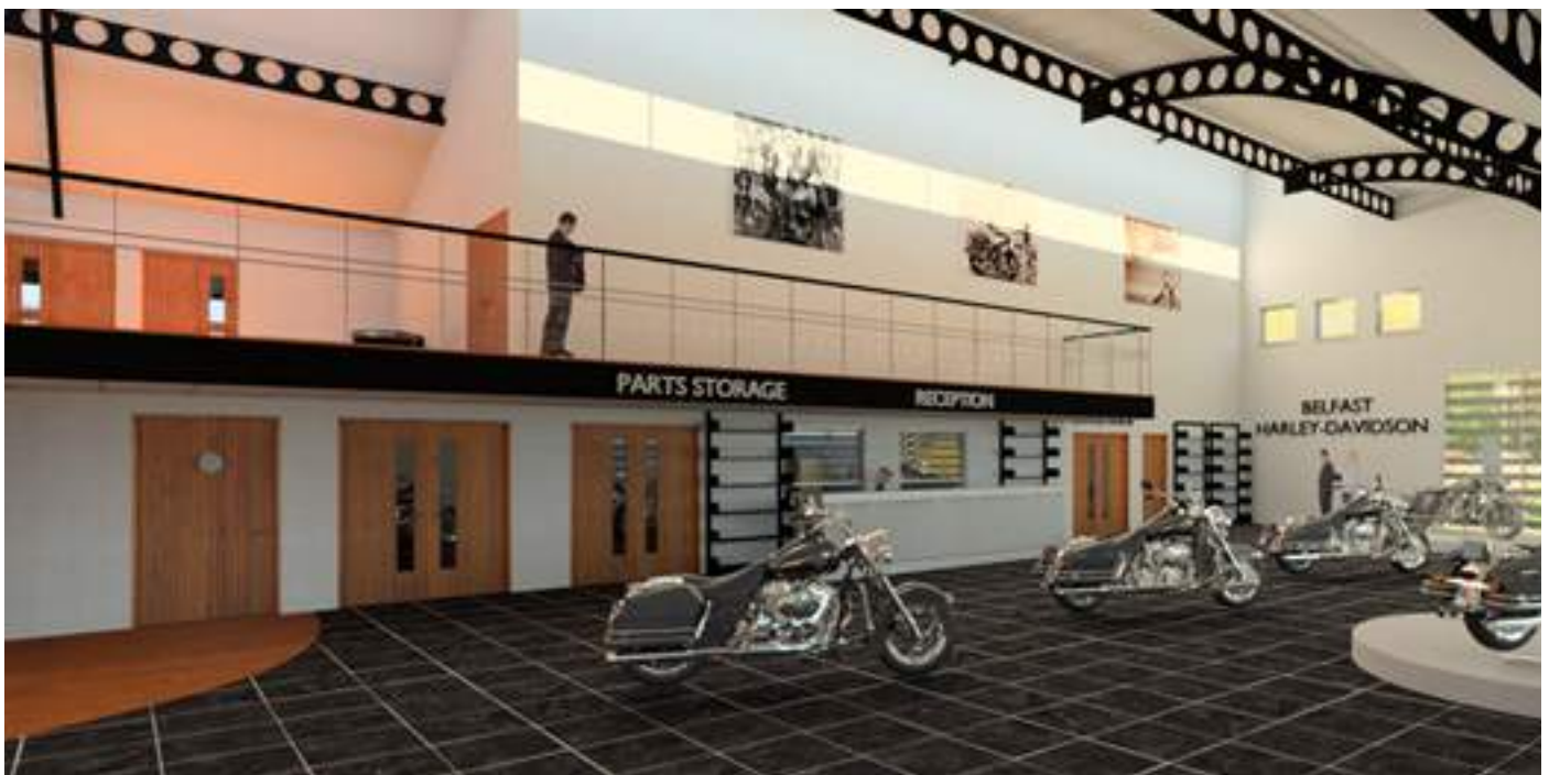
Below: inside the Harley Davidson Centre

Architectural Technology is a balance between science and aesthetics