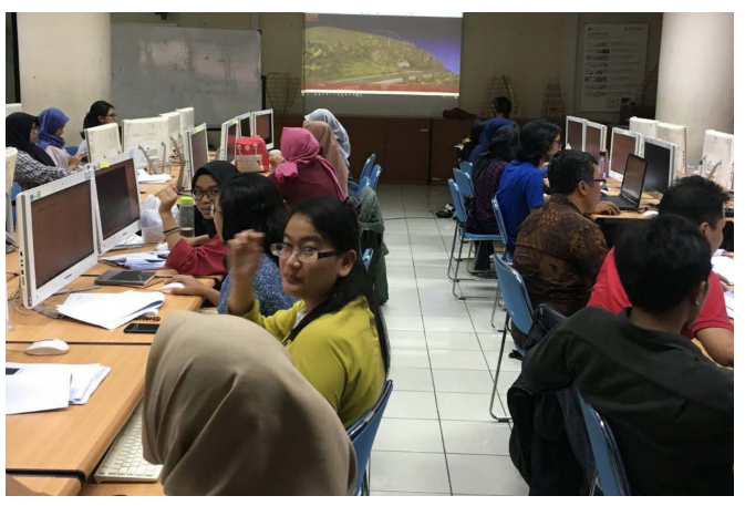
A workshop at ITB, Indonesia

As part of the international strategy at LSBU, we have used the sites in Indonesia as part of the undergraduate curriculum where students are required to design a sustainable building within the Construction Practice module. This module consists of over 300 students studying courses ranging from architectural technology, architecture, building surveying, project management, construction management, civil and building services engineering, boosting students' employability skills as they tackle realworld challenges.