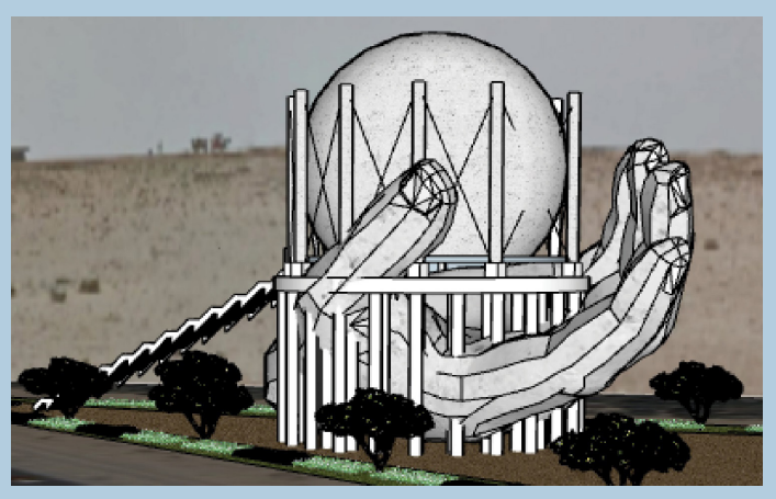
3D view of the eastern view of the building

The dome was made of pre-cast concrete panels with limestone which is fixed to the geodesic structure made of steel. There was a gap between the inner and outer wall, which was to act as a thermal jacket, trapping a layer of air around the building. At each horizontal junction of the panels were louvres, and the building would rely on buoyancy; having cool air come in from the bottom of the flues, taking the heat to interstitial elements and passing out through the louvres on top of the building. When the