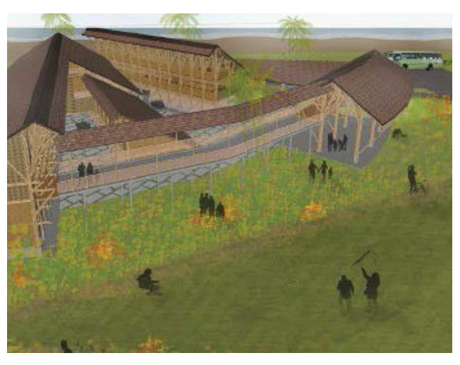
Examples of Material Hub Design proposed by students during competition

By creating a partnership that values creativity, innovation and knowledge sharing, we have ensured that the educational benefits of the project were widespread. Participating students have also gained direct experience off industrial-scale problem solving within an international, multi-disciplinary context.