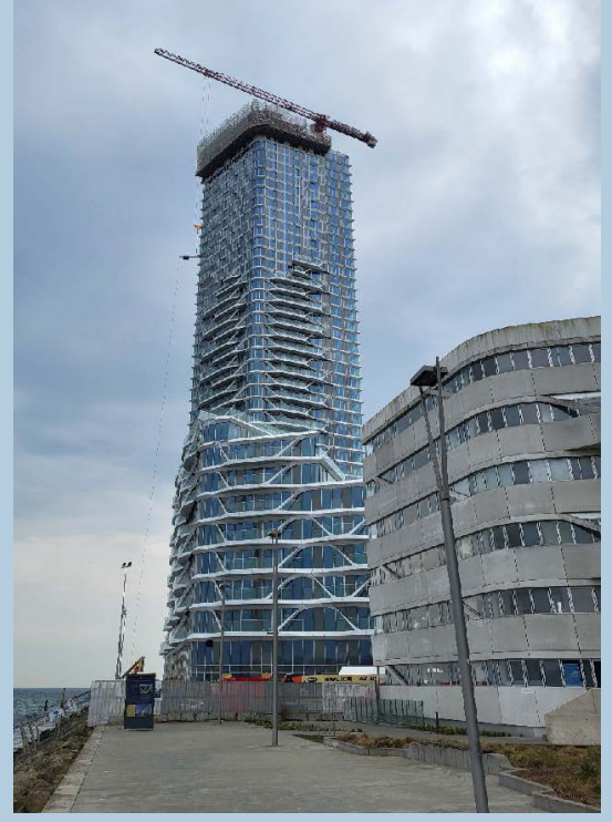
The Lighthouse currently under construction

Surrounded by the sea and overlooking both the forest and the city, this iconic project has already been designated a landmark for the city of Aarhus. For me, it represents the beginning of what I hope to be a long and rewarding career within the construction industry.