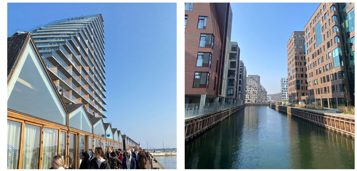
Students on the tour walk past AARhus

You can see a map of the Aarhus Ø development, including details of all the projects here.