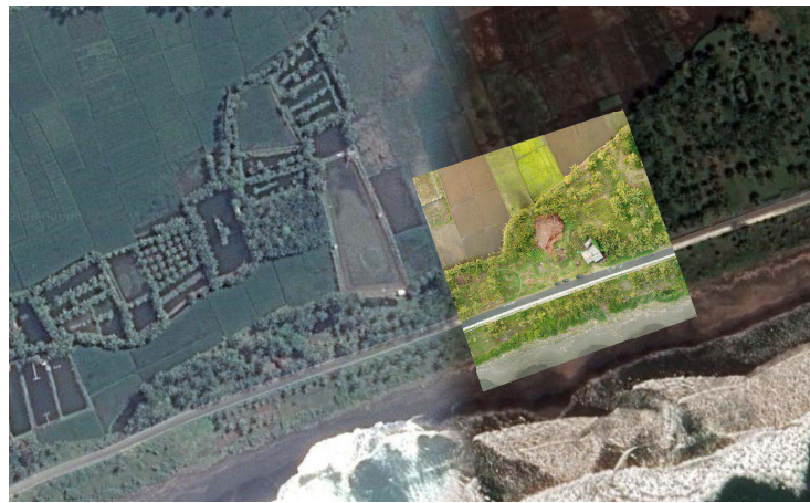
Aerial images showing the Bojong Salaweh site as a suitable site for the design competition

Multiple aerial surveys using unmanned drones were carried out and 3D visualisation of the sites were produced to help inform the design competition process.